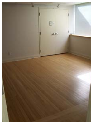
14.0ft x 20.0ft

Please note that special pricing maybe available for long term rentals.