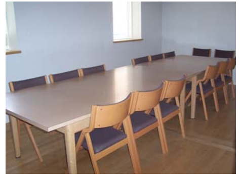
20.75ft x 11.75ft