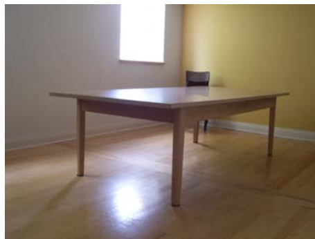
16.74ft x 11.75ft