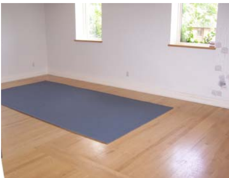
15.25ft x 22.0ft